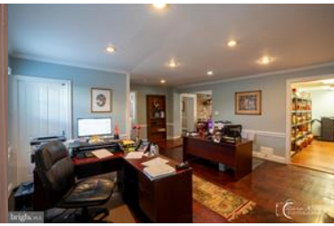
Open Office Area - 1st Fl