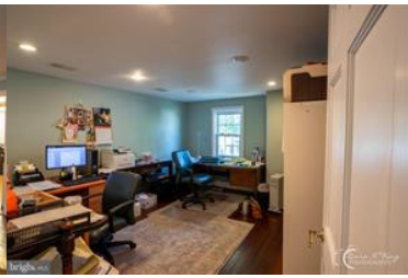
Open Office Area - 2nd Fl