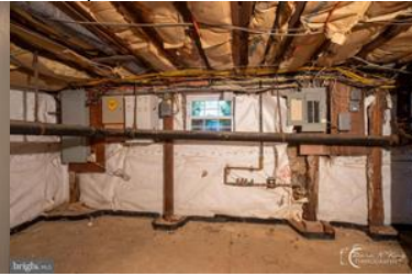
Basement & Utilities

© BRIGHT MLS - Content is reliable but not guaranteed and should be independently verified (e.g., measurements may not be exact; visuals may be modified; school boundaries should be confirmed by school/district). Any offer of compensation is for MLS subscribers subject to Bright MLS policies and applicable agreements with other MLSs. Copyright 2024. Created: 10/18/2024 02:41 PM