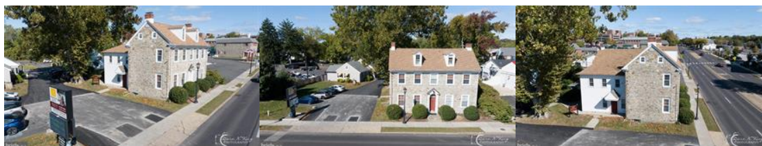
Exterior Building View & Curb Sign