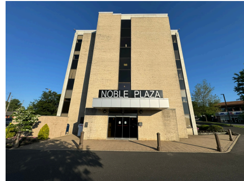
First Floor Lobby Entrance