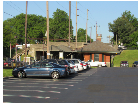
Noble Train Station