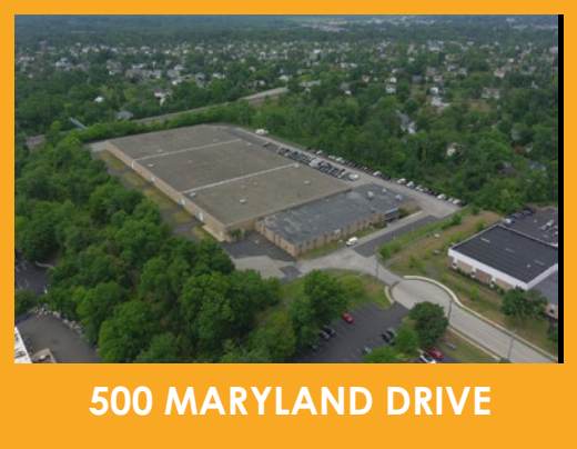
500 MARYLAND DRIVE