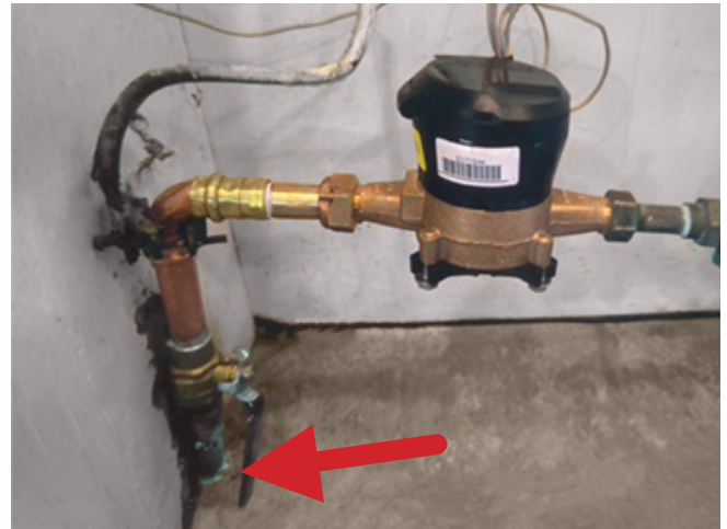
Water service line penetrating the floor