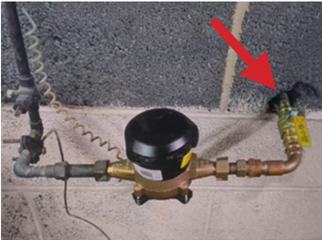
Water service line penetrating the wall