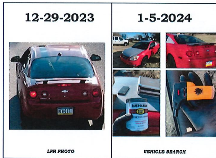
License Plate Reader Photograph December 29, 2023 Vehicle Search January 5, 2024