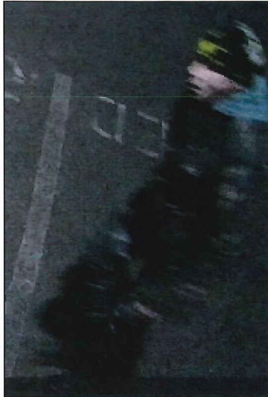
Surveillance Video: "Premier Environments", 601 Davisville Road, Willow Grove, PA 19090 December 29, 2023 2043 hrs.