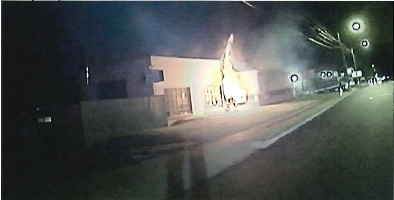
Body Worn Camera, Ofc. K. Kramer "JG Transmissions", 616 Davisville Road, Willow Grove, PA 19090 December 29, 2023 approximately 2045 hrs.

Responding Fire Departments arrived a short time later and were ultimately successful in extinguishing the fire. "JG Transmissions" was effectively destroyed by the fire.