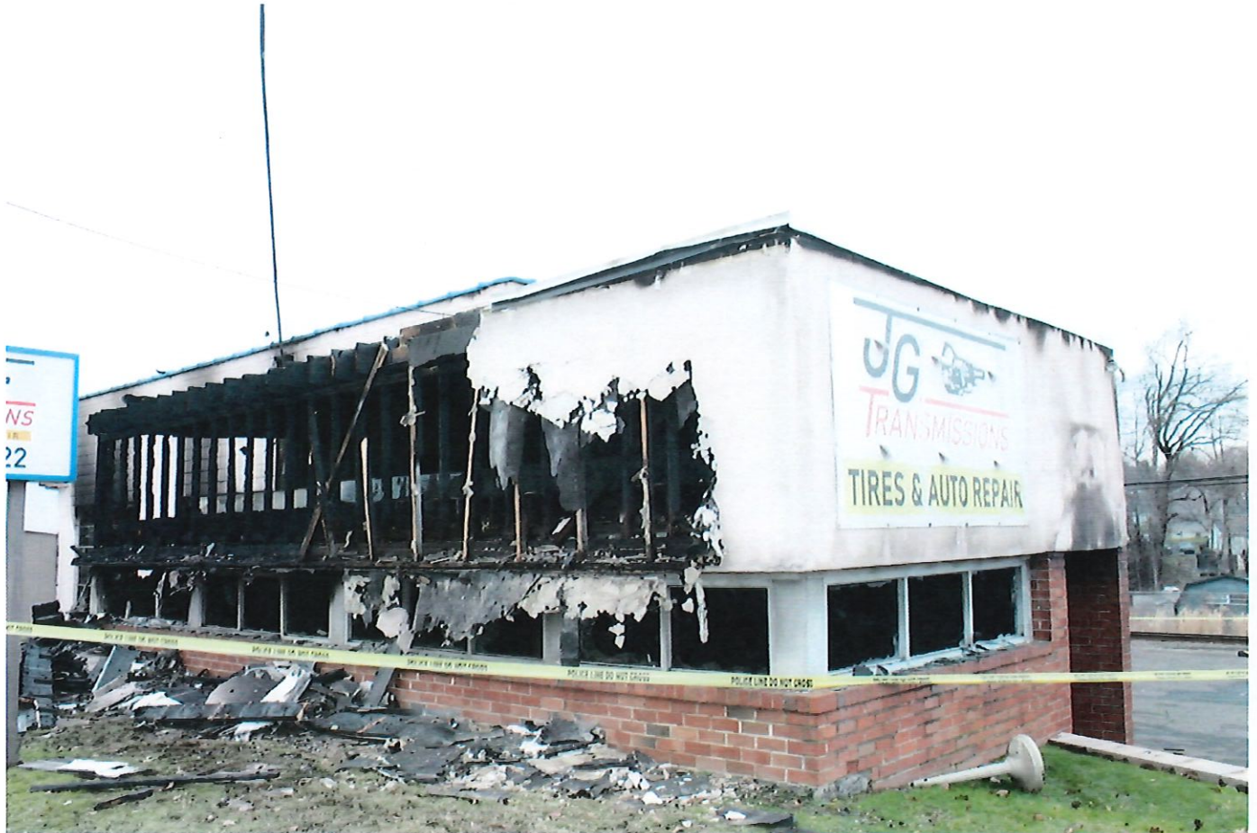
"JG Transmissions", 616 Davisville Road, Willow Grove, PA 19090 December 30, 2023