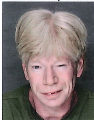
Booking Photo: Lebanon County Central Booking, January 1, 2024